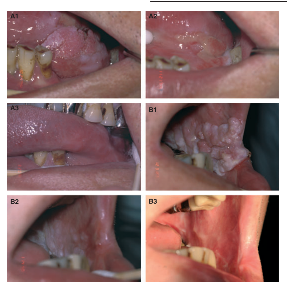
Figure 1 Clinical photographs of patients with oral verrucous hyperplasia (OVH) before and after the laser light-mediated topical ALA-PDT treatment. A: An OVH lesion on the left posterior lateral border of the tongue before biopsy (A1), after four treatments of PDT showing partial response (PR) (A2), and after six treatments of PDT showing complete response (CR) (A3). B: An OVH lesion on the left buccal mucosa before biopsy (B1), after four treatments of PDT showing PR (B2), and after six treatments of PDT showing CR (B3).